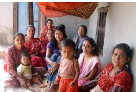
Kids enjoyed learning about vegetables as well!