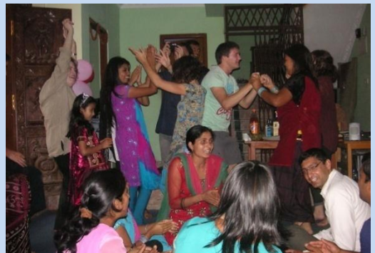
Volunteers and staff dancing at the Dashain Party at the VIN office