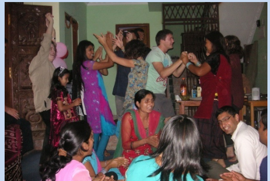
Volunteers and staff dancing at the Dashain Party at the VIN office