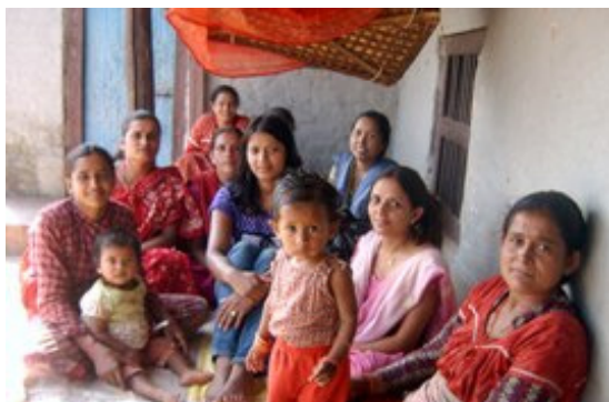
Kids enjoyed learning about vegetables as well!